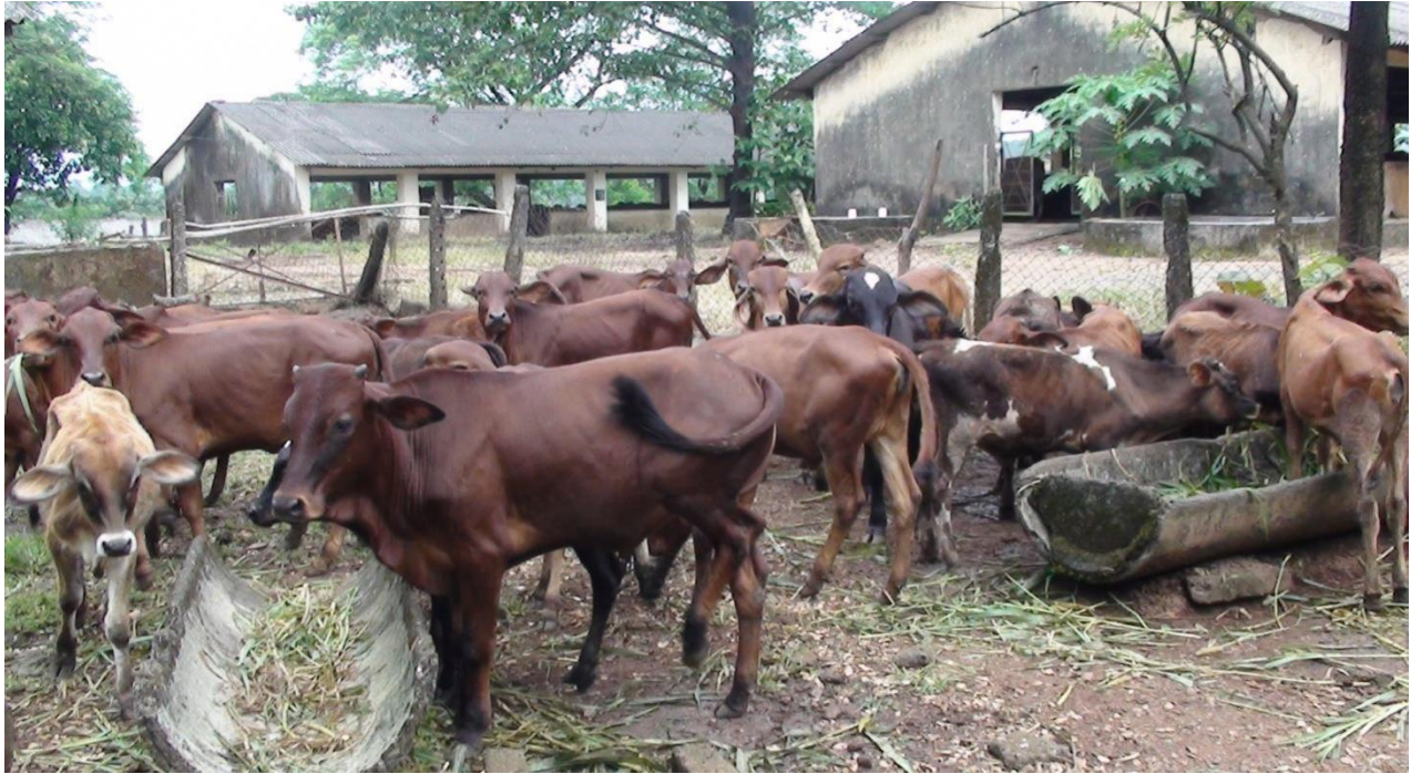
Cattle Breeding Farm, Copardem, Sattari Goa