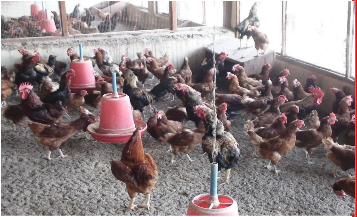
Govt. Poultry Farm, Ela Old Goa.