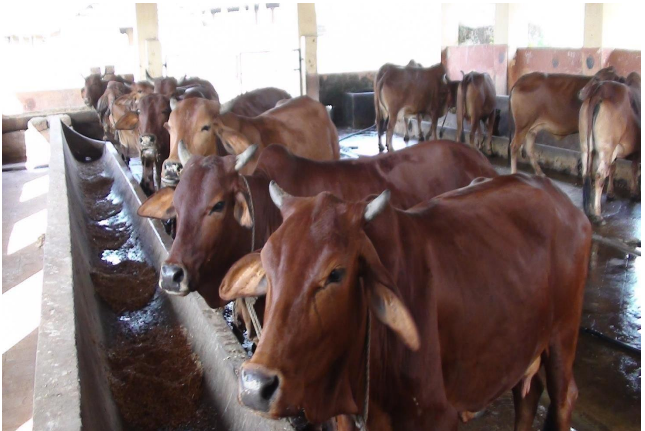
Government Livestock Farm, Dhat, Mollem, Goa