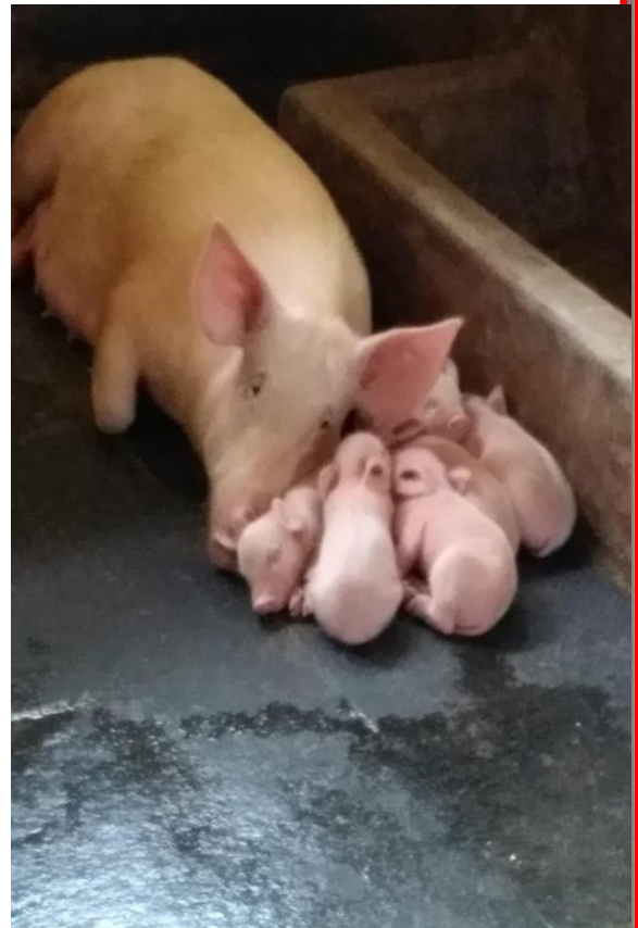
Govt. Piggery Farm, Curti, Ponda Goa.